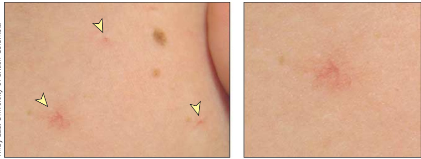
Figure 1. Spider Nevi Lesions on the Upper Chest

patic function. 1 Palmar erythema, spider nevi, gynecomastia, decreased body hair, and testicular atrophy are thought to result from decreased hepatic metabolism and clearance of androstenedione, allowing increased peripheral conversion to estrogen. 23 Loss of functioning hepatocellular mass leads to jaundice and hypoalbuminemia. 24 Thrombocytopenia may result from hypersplenism or direct bone marrow suppression. Liver production of coagulation factors I, II, V, VII, IX, and X is reduced in chronic liver disease. Factors II, VII, IX, and X are further reduced by vitamin K deficiency due to cholestasis. 25 Prothrombin time can be selectively elevated because factor VII is the first factor to be depleted in cirrhosis due to its short half-life. 26 Gastroesophageal varices and splenomegaly are sequelae of portal hypertension, which is defined as an increase in portal venous pressure gradient above 10 mm Hg. 27 Edema, ascites, and hepatic encephalopathy result from both hepatocellular insufficiency and portal hypertension. 28-30